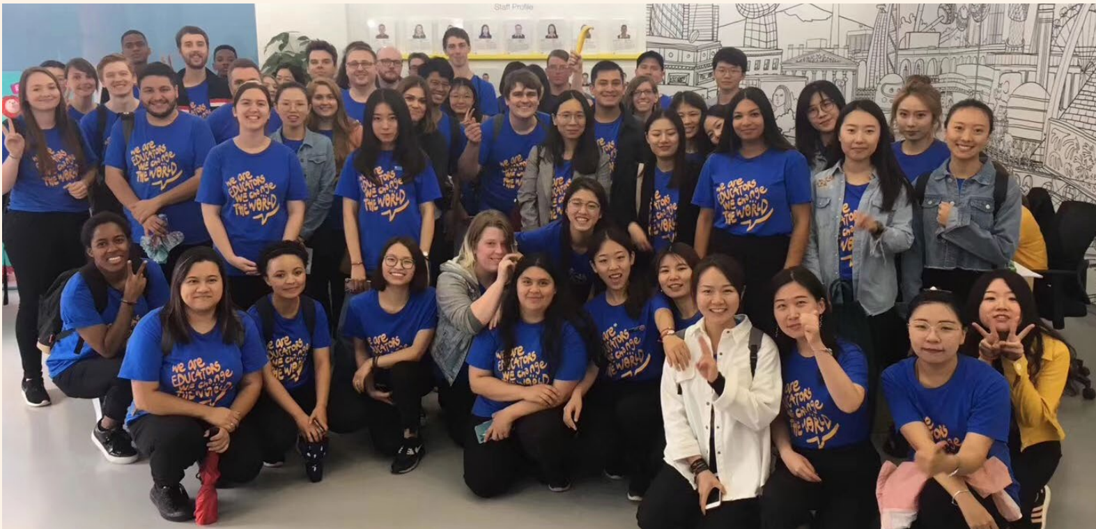
Pictured Summer Course 2019 Training